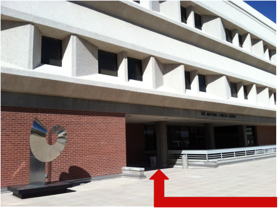
Enter through here 😊

Arizona Cancer Center building is a few hundred feet from main hospital entrance. Look for the silver statue. Room 2920 is just through this entrance. There will be clear signage and a staff member outside to direct all students on the first day.